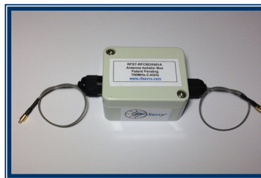
Fig 1.0 Antenna Isolator Box (NEMA 4.X Enclosure/Cable glands) (MMCX term. for illustration only)