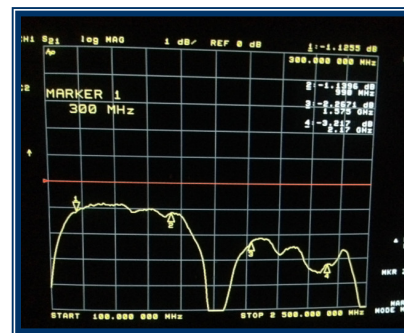
Fig 2.0 RF Coupler Insertion Loss S21 (dB) *